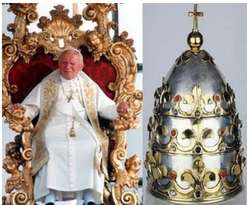
Bl. John Paul II and his Hungarian tiara