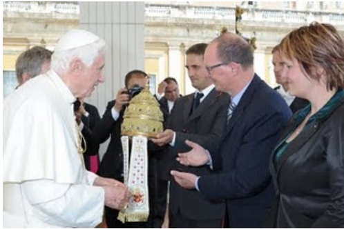
Benedict XVI presented with his tiara

was proper to have a coronation, it was not appropriate to do so at his time because of the recent, tragic loss of his predecessor. However, not many know that Bl. John Paul II did have a tiara of his own. It was more traditional than that of Paul VI but still rather simple when compared to others as it was made in Hungary, behind the "Iron Curtain", smuggled out and presented to the Pontiff as a symbol of the determined faith of the Catholic Hungarians. It was never worn of course and its existence only made public after the end of the communist regime. Pope Benedict's tiara was presented to the Pontiff at his Wednesday general audience by a delegation of Catholic and Orthodox pilgrims in the name of Christian unity.